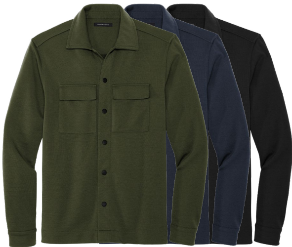
MERCER + METTLE Double-Knit Snap Front Jacket MM3004 Adult Sizes: XS-4XL | 3 colors