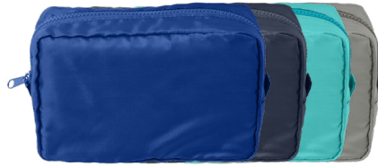
PORT AUTHORITY Stash Dimensional Pouch BG916 6 colors