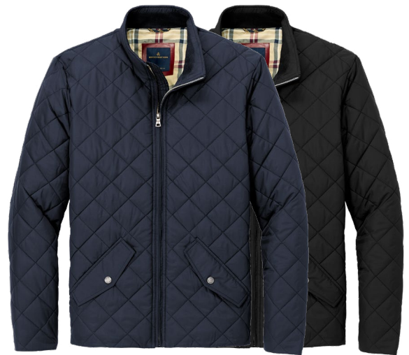
BROOKS BROTHERS Quilted Jacket BB18600 Adult Sizes: XS-4XL | 2 colors