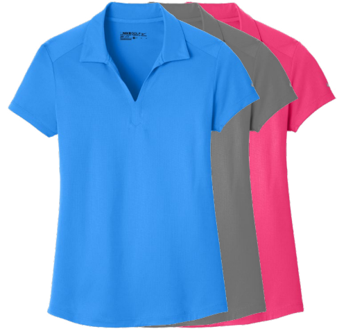
NIKE Ladies Dri-FIT Legacy Polo 838957 Women's Sizes: XS-2XL | 6 colors