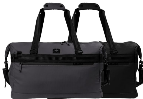
OGIO Commuter Duffel 411098 2 colors