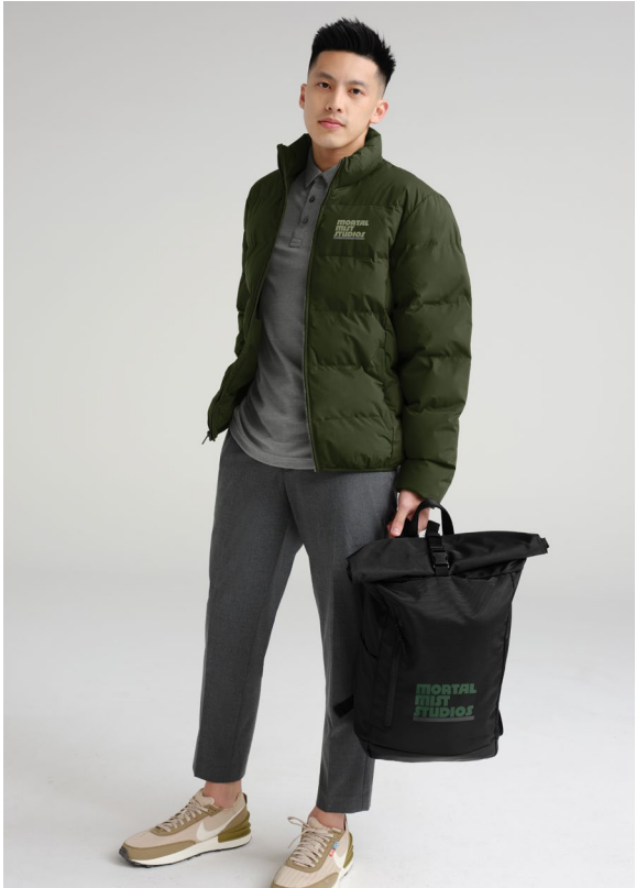
MERCER + METTLE Rucksack MMB201 One Size Fits All | 1 color Worn with TM1MU412, MM7210