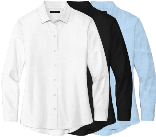
MERCER + METTLE Women's Long Sleeve Stretch Woven Shirt MM2001 Women's Sizes: XS-4XL | 4 colors