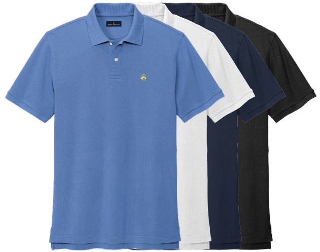
BROOKS BROTHERS Pima Cotton Pique Polo BB18200 Adult Sizes: XS-4XL | 6 colors