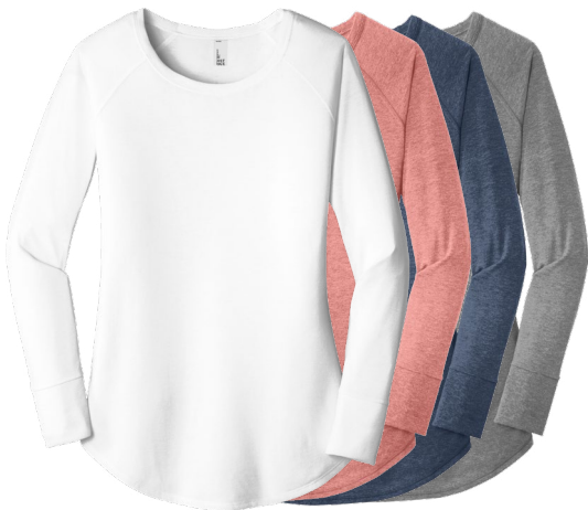
DISTRICT Women's Perfect Tri Long Sleeve Tunic Tee DT132L Women's Sizes: XS-4XL | 5 colors

Uplift the whole team with outfits that speak to a cohesive vision, a laid-back attitude and a clear focus on accomplishing great work together.