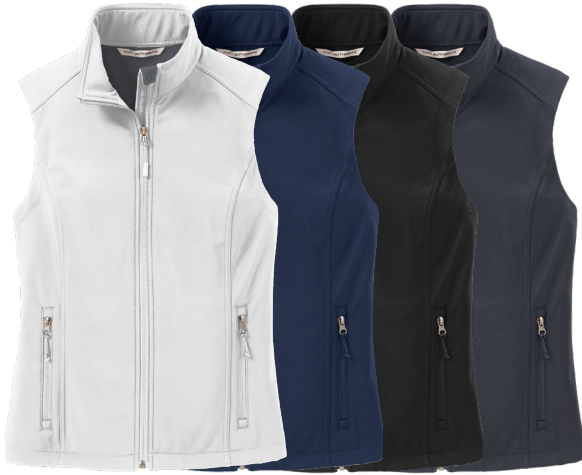
PORT AUTHORITY Ladies Core Soft Shell Vest L325 Women's Sizes: XS-4XL | 5 colors