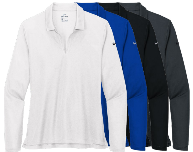
NIKE Ladies Dri-FIT Micro Pique 2.0 Long Sleeve Polo NKDC2105 Women's Sizes: S-2XL | 7 colors