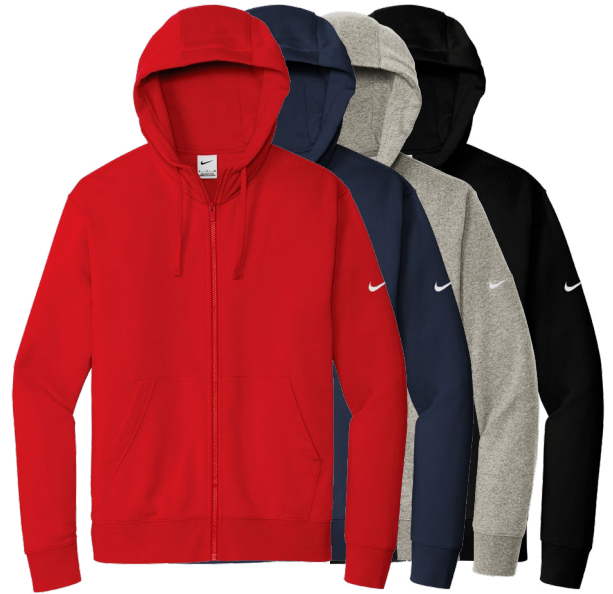
NIKE Club Fleece Sleeve Swoosh Full-Zip Hoodie NKDR1513 Adult Sizes: XS-4XL | 6 colors