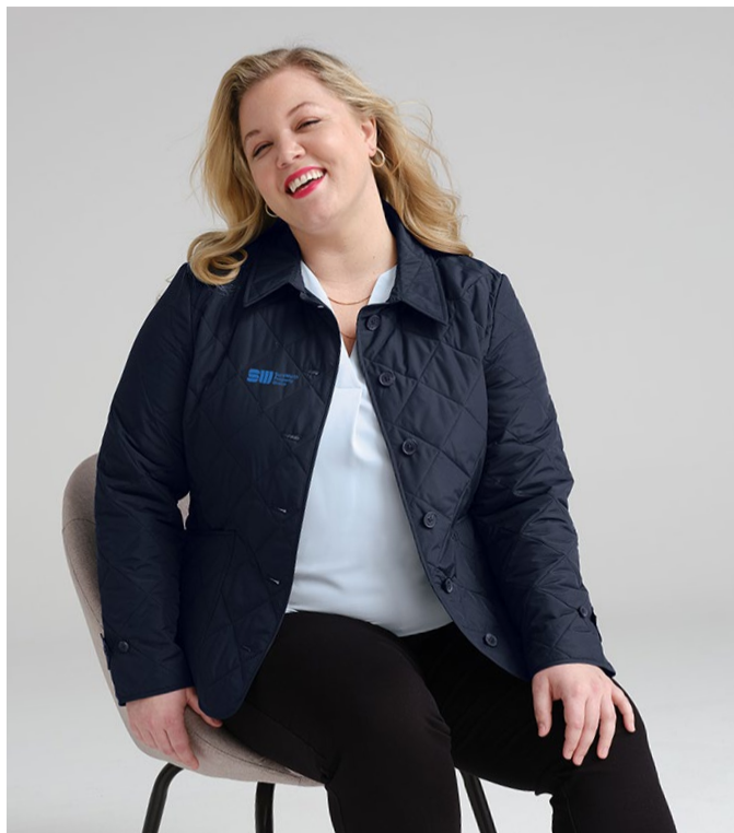
BROOKS BROTHERS Women's Quilted Jacket BB18601 Women's Sizes: XS-4XL | 2 colors Worn with BB18009