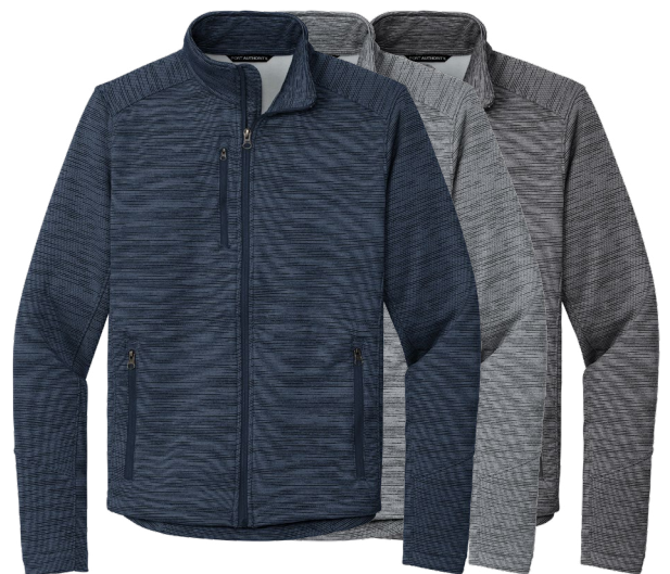
PORT AUTHORITY Digi Stripe Fleece Jacket F231 Adult Sizes: XS-4XL | 3 colors