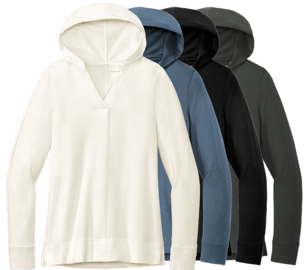
PORT AUTHORITY Ladies Microterry Pullover Hoodie LK826 Women's Sizes: XS-4XL | 4 colors