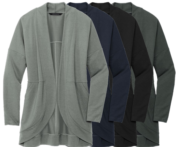
MERCER + METTLE Women's Stretch Open-Front Cardigan MM3015 Women's Sizes: XS-4XL | 4 colors