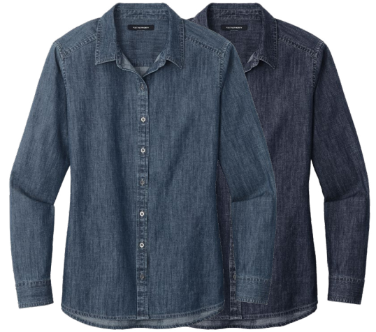
PORT AUTHORITY Ladies Long Sleeve Perfect Denim Shirt LW676 Women's Sizes: XS-4XL | 2 colors