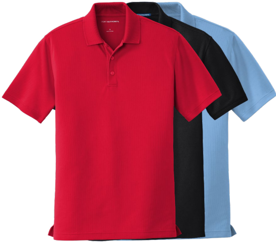
PORT AUTHORITY Dry Zone UV Micro-Mesh Polo K110 Adult Sizes: XS-6XL | 16 colors