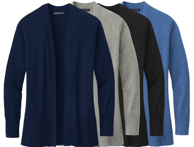
BROOKS BROTHERS Women's Cotton Stretch Long Cardigan Sweater BB18403 Women's Sizes: XS-4XL | 4 colors