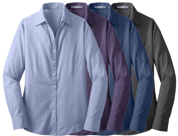
PORT AUTHORITY Ladies Crosshatch Easy Care Shirt L640 Women's Sizes: XS-4XL | 4 colors