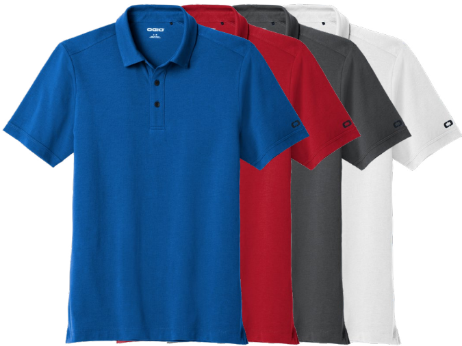
OGIO Limit Polo OG138 Adult Sizes: XS-4XL | 6 colors