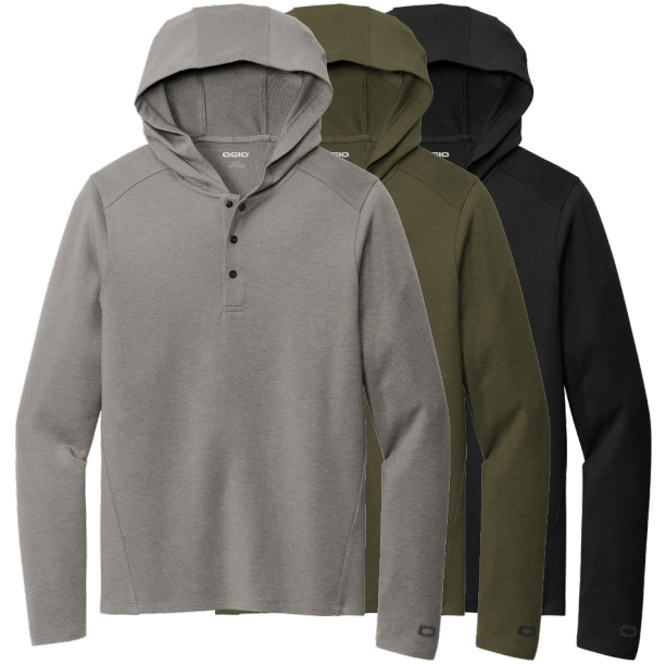
OGIO Luuma Flex Hooded Henley OG826 Adult Sizes: XS-4XL | 3 colors