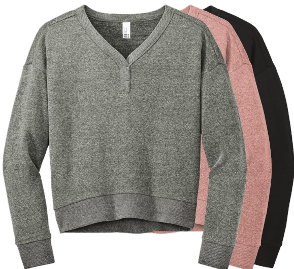
DISTRICT Ladies Perfect Tri Fleece V-Neck Sweatshirt DT1312 Women's Sizes: XS-4XL | 5 colors