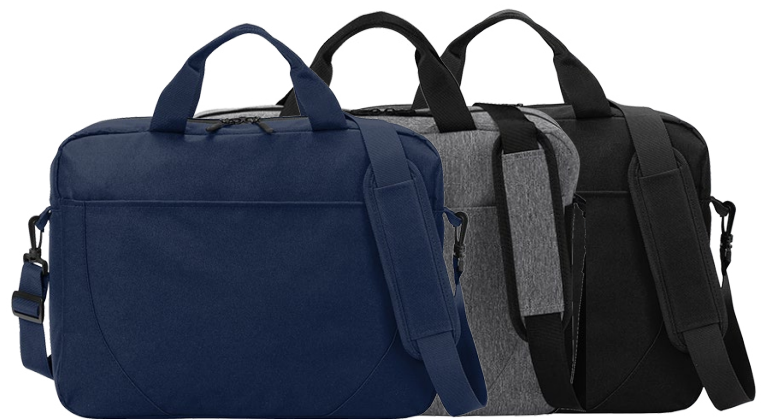
PORT AUTHORITY Access Briefcase BG318 3 colors