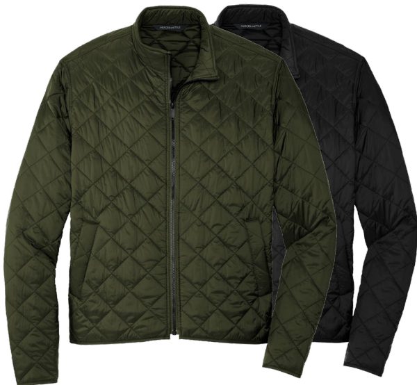
MERCER + METTLE Quilted Full-Zip Jacket MM7200 Adult Sizes: XS-3XL | 2 colors