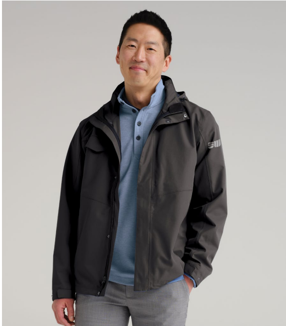
PORT AUTHORITY Collective Outer Shell Jacket J900 Adult Sizes: XS-4XL | 4 colors Worn with NKDC2104, BB18202