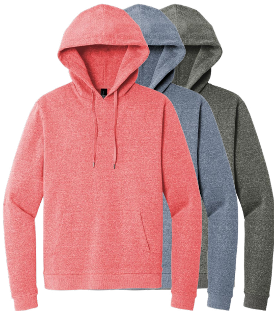
DISTRICT Perfect Tri Fleece Pullover Hoodie DT1300 Adult Sizes: XS-4XL | 12 colors