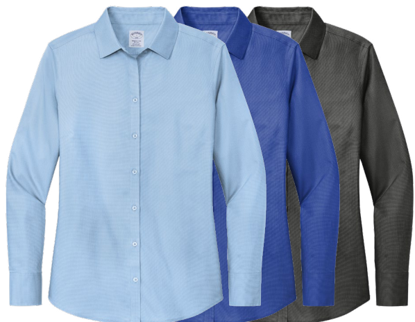
BROOKS BROTHERS Wrinkle Free Women's Stretch Nailhead Shirt BB18003 Women's Sizes: XS-4XL | 6 colors