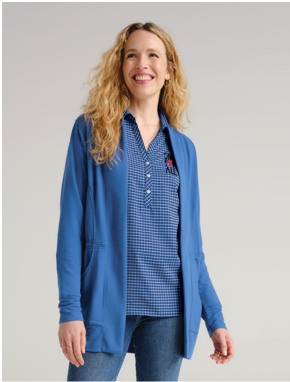
PORT AUTHORITY Ladies Microterry Cardigan LK825 Women's Sizes: XS-4XL | 4 colors Worn with LW680