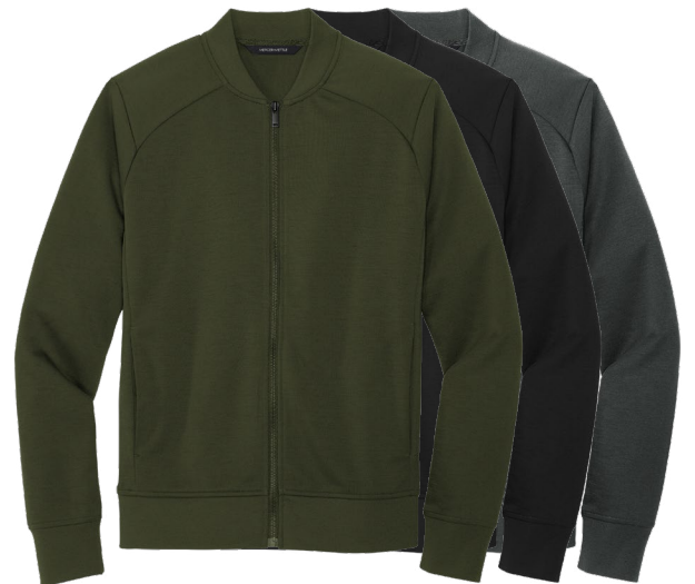
MERCER + METTLE Double-Knit Bomber MM3000 Adult Sizes: XS-4XL | 4 colors