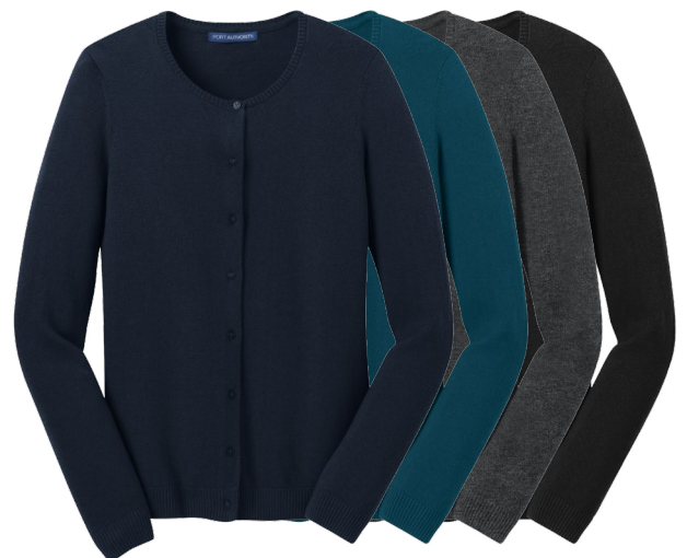
PORT AUTHORITY Ladies Cardigan Sweater LSW287 Women's Sizes: XS-4XL | 3 colors