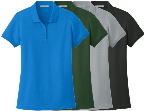
PORT AUTHORITY Ladies Core Classic Pique Polo L100 Women's Sizes: XS-6XL | 13 colors