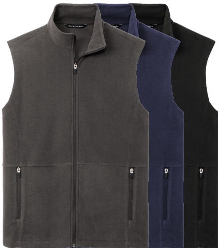
PORT AUTHORITY Accord Microfleece Vest F152 Adult Sizes: XS-4XL | 3 colors