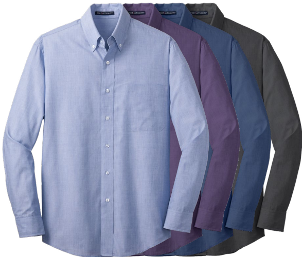
PORT AUTHORITY Crosshatch Easy Care Shirt S640 Adult Sizes: XS-4XL | 4 colors