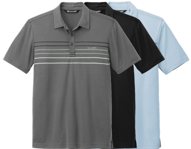
TRAVISMATHEW Coto Performance Chest Stripe Polo TM1MY400 Adult Sizes: S-3XL | 3 colors