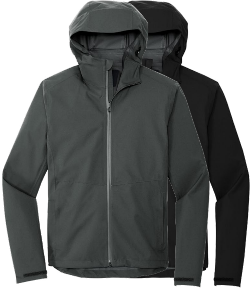
MERCER + METTLE Waterproof Rain Shell MM7000 Adult Sizes: XS-4XL | 2 colors