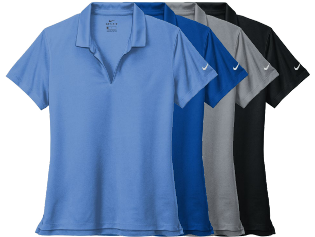
NIKE Ladies Dri-FIT Micro Pique 2.0 Polo NKDC1991 Women's Sizes: S-2XL | 20 colors