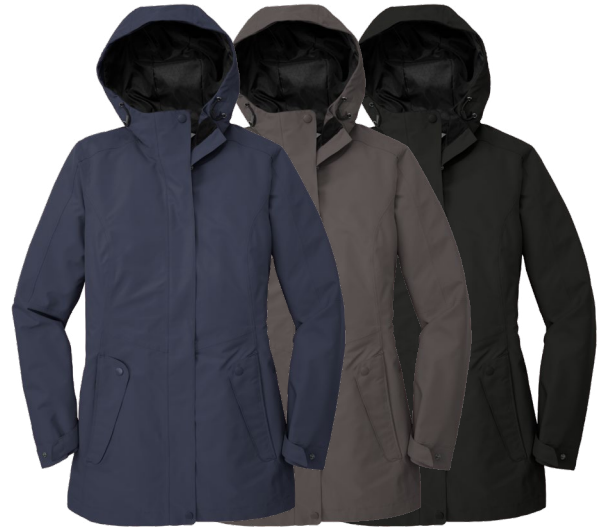
PORT AUTHORITY Ladies Collective Outer Shell Jacket L900 Women's Sizes: XS-4XL | 4 colors