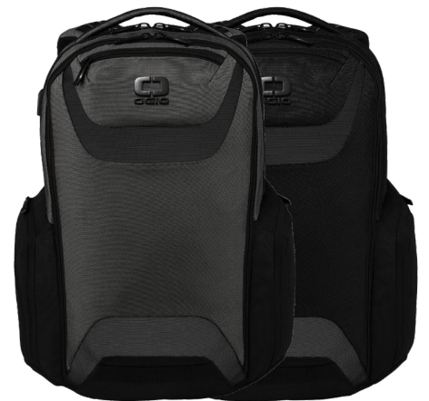
OGIO Connected Pack 91008 2 colors