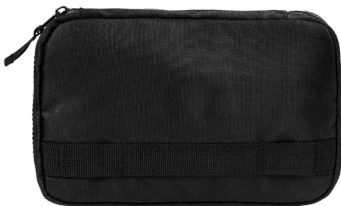
MERCER + METTLE Utility Case MMB700 1 color