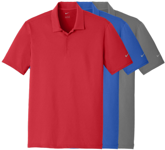
NIKE Dri-FIT Legacy Polo 883681 Adult Sizes: XS-4XL | 6 colors