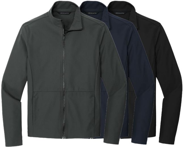
MERCER + METTLE Faillie Soft Shell MM7100 Adult Sizes: XS-4XL | 3 colors