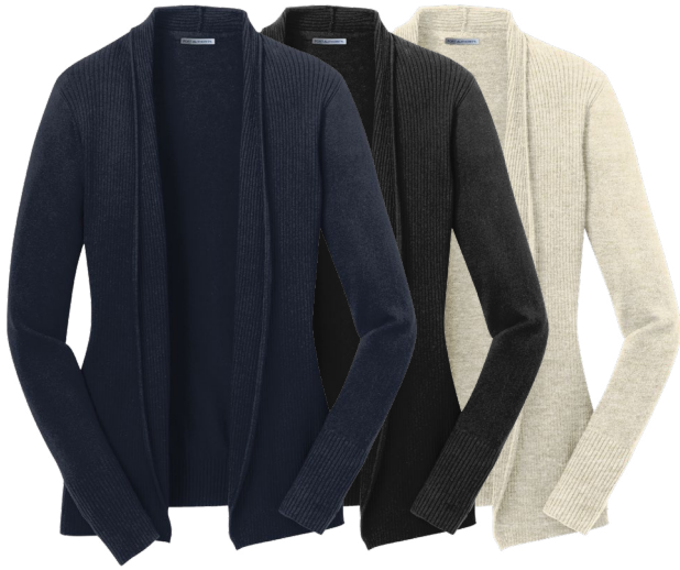
PORT AUTHORITY Ladies Open Front Cardigan Sweater LSW289 Women's Sizes: XS-4XL | 4 colors