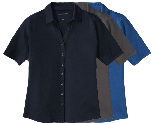
PORT AUTHORITY Ladies City Stretch Top LK682 Women's Sizes: XS-4XL | 5 colors