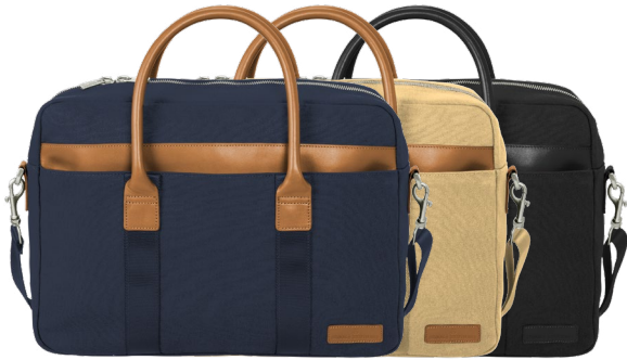
BROOKS BROTHERS Wells Briefcase BB18830 3 colors