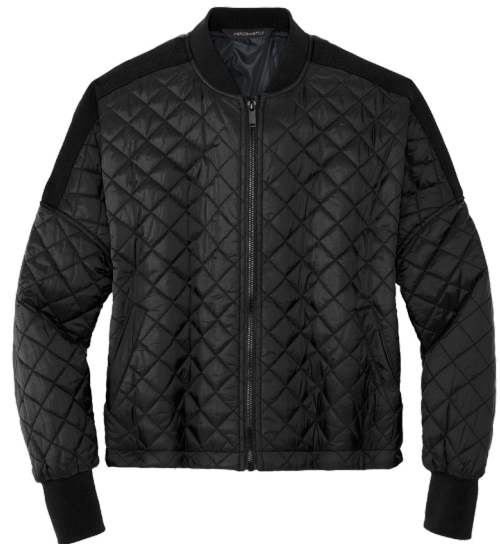
MERCER + METTLE Women's Boxy Quilted Jacket MM7201 Women's Sizes: XS-4XL | 1 color