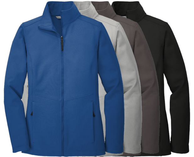
PORT AUTHORITY Ladies Collective Soft Shell Jacket L901 Women's Sizes: XS-4XL | 5 colors