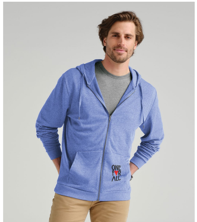
DISTRICT Perfect Tri Fleece Full-Zip Hoodie DT1302 Adult Sizes: XS-4XL | 6 colors Worn with DM130