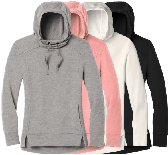
OGIO Ladies Luuma Pullover Fleece Hoodie LOG810 Women's Sizes: XS-4XL | 4 colors