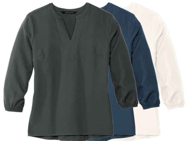
MERCER + METTLE Women's Stretch Crepe 3/4-Sleeve Blouse MM2011 Women's Sizes: XS-4XL | 5 colors