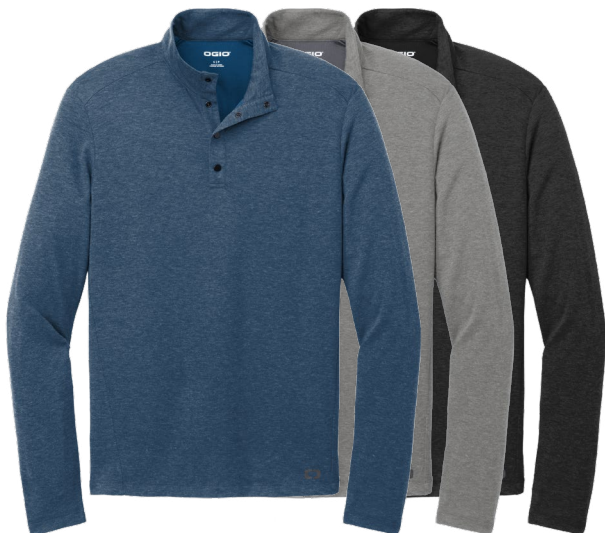
OGIO Command 1/4-Snap OG151 Adult Sizes: XS-4XL | 3 colors