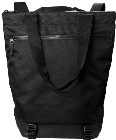
MERCER + METTLE Convertible Tote MMB202 1 color