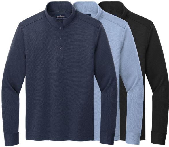
BROOKS BROTHERS Mid-Layer Stretch 1/2 Button BB18202 Adult Sizes: XS-4XL | 5 colors