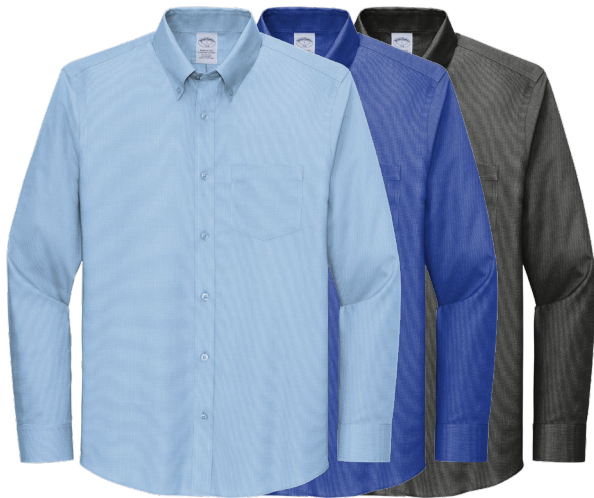
BROOKS BROTHERS Wrinkle Free Stretch Nailhead Shirt BB18002 Adult Sizes: XS-4XL | 6 colors