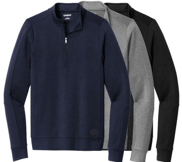
OGIO Luuma 1/2-Zip Fleece OG813 Adult Sizes: XS-4XL | 3 colors