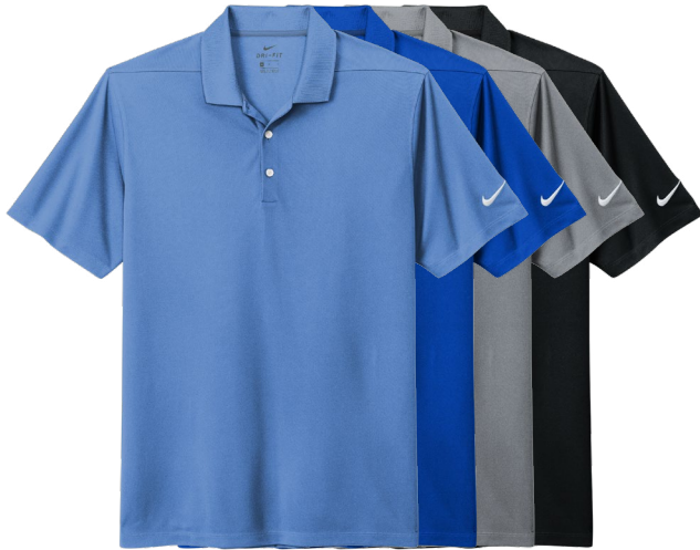
NIKE Dri-FIT Micro Pique 2.0 Polo NKDC1963 Adult Sizes: XS-4XLT | 20 colors