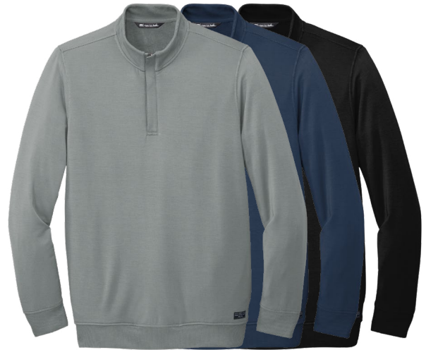
TRAVISMATHEW Newport 1/4-Zip Fleece TM1MU419 Adult Sizes: S-3XL | 3 colors