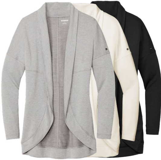
OGIO Ladies Luuma Coccoon Fleece LOG811 Women's Sizes: XS-4XL | 3 colors