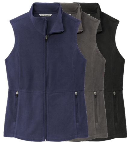
PORT AUTHORITY Ladies Accord Microfleece Vest L152 Women's Sizes: XS-4XL | 3 colors