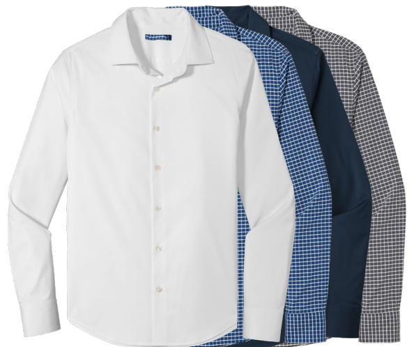
PORT AUTHORITY City Stretch Shirt W680 Adult Sizes: XS-4XL | 5 colors