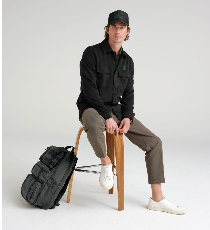
OGIO Utilitarian Modular Pack 91018 2 colors