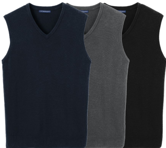
PORT AUTHORITY Sweater Vest SW286 Adult Sizes: XS-4XL | 3 colors