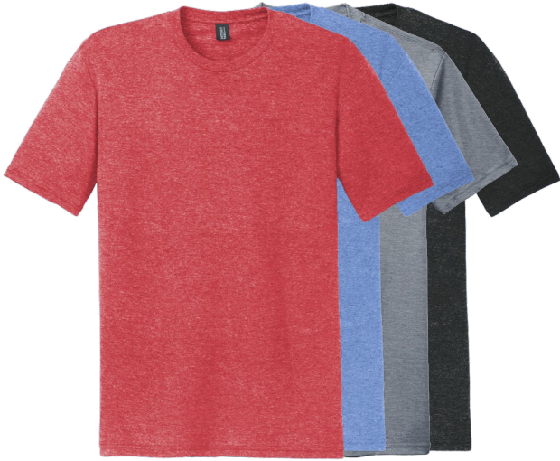
DISTRICT Perfect Tri Tee DM130 Adult Sizes: XS-4XL | 35 colors