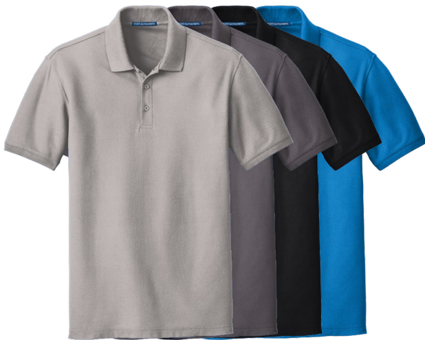
PORT AUTHORITY Core Classic Pique Polo K100 Adult Sizes: XS-6XL | 12 colors