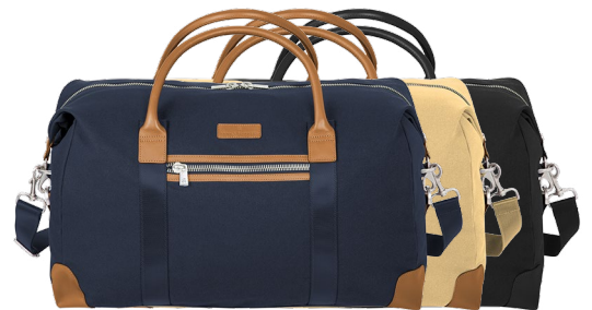
BROOKS BROTHERS Wells Duffel BB18880 3 colors

Heat Transfer is the most effective technique for these styles