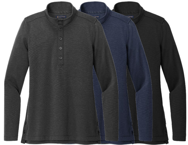
BROOKS BROTHERS Women's Mid-Layer Stretch 1/2 Button BB18203 Women's Sizes: XS-4XL | 3 colors