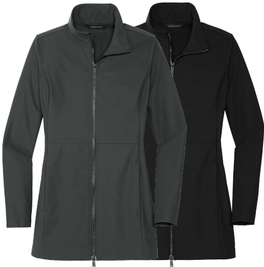
MERCER + METTLE Women's Faillie Soft Shell MM7101 Women's Sizes: XS-4XL | 2 colors