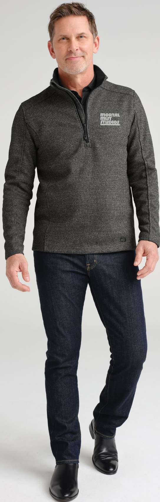
OGIO Grit Fleece 1/2-Zip OG729 Adult Sizes: XS-4XL | 2 colors Worn with TM1MY399