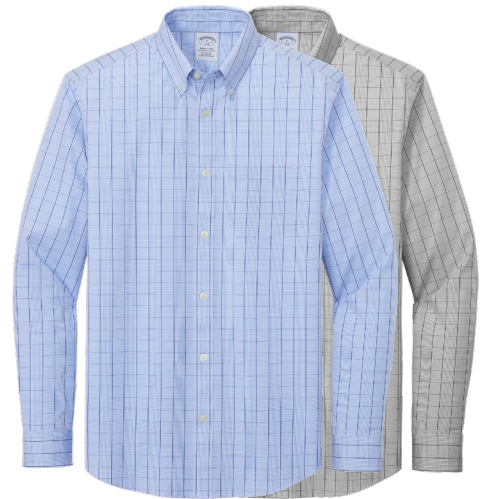
BROOKS BROTHERS Wrinkle Free Stretch Patterned Shirt BB18008 Adult Sizes: XS-4XL | 2 colors

Buttoned-up should not mean boring. A true classic look brings the team together with a sense of professionalism and pride.