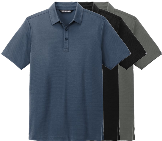
TRAVISMATHEW Bayfront Solid Polo TM1MY399 Adult Sizes: S-3XL | 4 colors