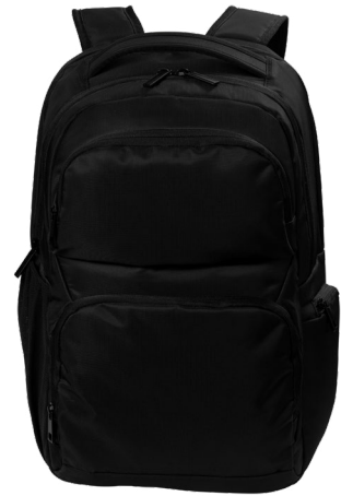
PORT AUTHORITY Transit Backpack BG224 1 color