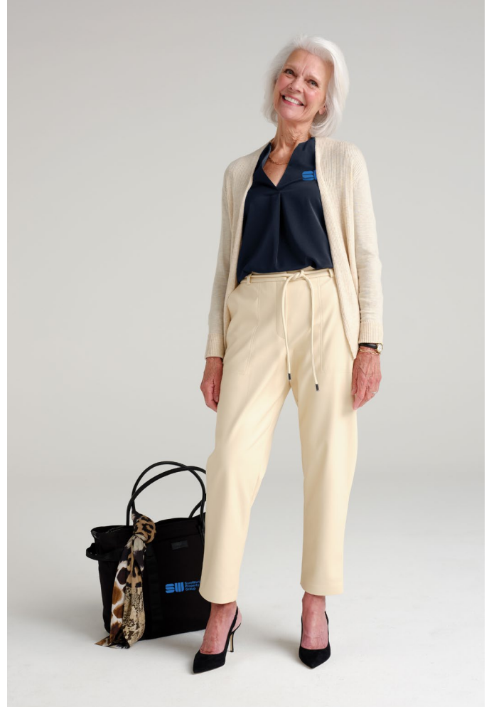
BROOKS BROTHERS Wells Laptop Tote BB18840 2 colors Worn with BB18009, LSW289