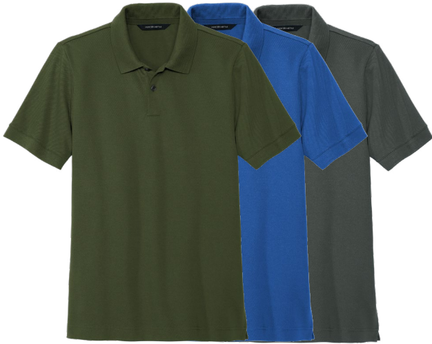
MERCER + METTLE Stretch Heavyweight Pique Polo MM1000 Adult Sizes: XS-4XL | 8 colors