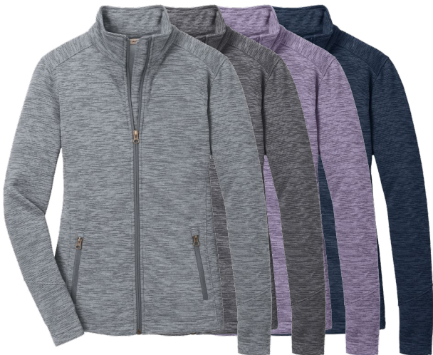
PORT AUTHORITY Ladies Digi Stripe Fleece Jacket L231 Women's Sizes: XS-4XL | 4 colors