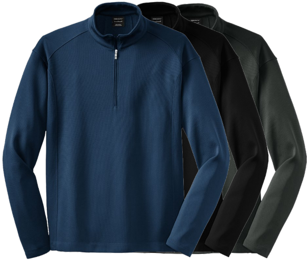
NIKE Sport Cover-Up 400099 Adult Sizes: XS-4XL | 3 colors