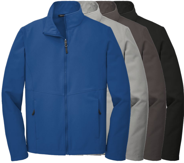
PORT AUTHORITY Collective Soft Shell Jacket J901 Adult Sizes: XS-4XL | 5 colors