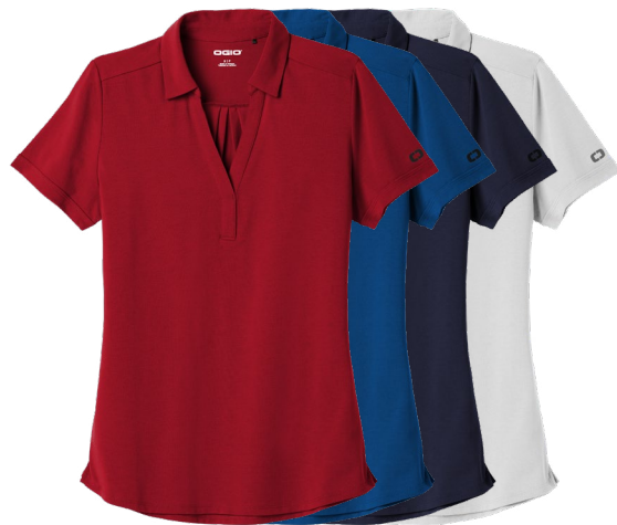
OGIO Ladies Limit Polo LOG138 Women's Sizes: XS-4XL | 7 colors