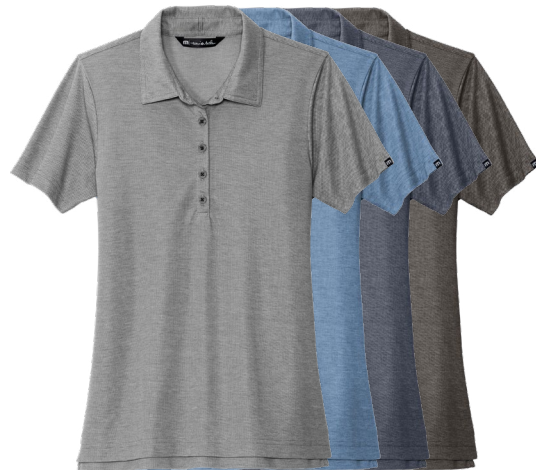
TRAVISMATHEW Ladies Oceanside Heather Polo TM1WW002 Women's Sizes: S-2XL | 6 colors