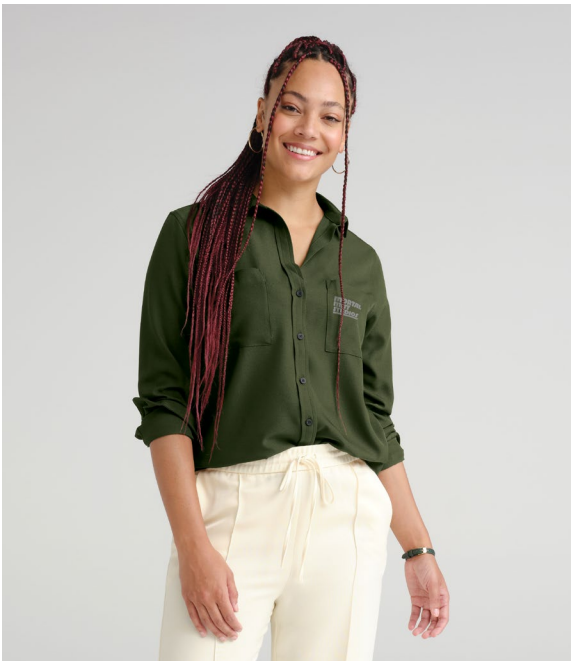
MERCER + METTLE Women's Stretch Crepe Long Sleeve Camp Blouse MM2013 Women's Sizes: XS-4XL | 4 colors